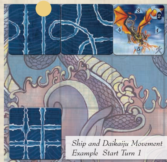
Ship and Daikaiju Movement Example Start Turn 1