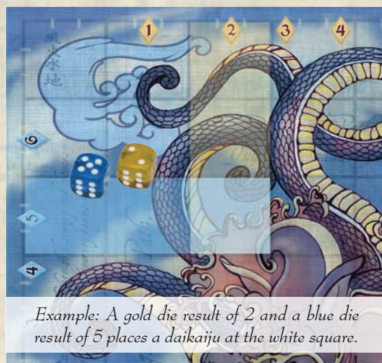
Example: A gold die result of 2 and a blue die result of 5 places a daikaiju at the white square.

Shuffle the daikaiju tiles and place them face down. The number of daikaiju placed on the board at the start of the game is based upon the number of players: For 2 to 4 players place 6 daikaiju For 5 to 6 players place 5 daikaiju For 7 to 8 players place 4 daikaiju For each daikaiju to be placed, roll the gold and the blue die. Find the result of the gold die roll in the gold numbers along the top of the game board and then find the result of the blue die roll in the blue numbers along the left side of game board. Locate the square at the intersection of these two numbers and place a daikaiju tile face down in that square. If the result of the die roll places two daikaiju in the same square, re-roll to place the second daikaiju in a different square. Rotate each daikaiju tile in a random direction and turn it face up.