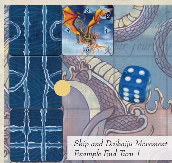
Ship and Daikaiju Movement Example End Turn 1

On Turn 1 of this example, the active player rolls a 4 for the movement of the daikaiju. The daikaiju moves to the left based on the position of the 4 arrow. When the daikaiju moves to the left, it replaces the wake tile in that square and the tile is removed from the game board. Now the active player places his wake tile and moves his ship. The position of his ship's wake and the movement of the daikaiju unfortunately places his ship close to the daikaiju at the start of turn 2.