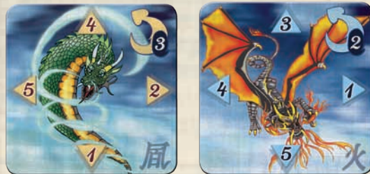
Daikaiju Tile Examples

The active player rolls to determine if a daikaiju moves on his or her turn. Roll both the gold and the blue dice. On a result of 6, 7, or 8 the daikaiju moves. Move or rotate the daikaiju in ascending order according to the rotation number in the corner of the tile (this is the number next to the curved arrow). If two daikaiju on the board have the same rotation number in the corner, move the daikaiju with the gold arrow first. To determine how each daikaiju moves roll a single die. Compare the result to each daikaiju tile and move them according to the following guidelines: On a result of 1–5, the daikaiju moves or rotates in the direction indicated by the directional arrows on each daikaiju tile. On a result of 6, the daikaiju does not move. Instead a new daikaiju tile is placed according to the Placing the Daikaiju rules in Setup.