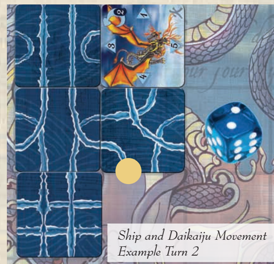
Ship and Daikaiju Movement Example Turn 2

On Turn 1 of this example, the active player rolls a 4 for the movement of the daikaiju. The daikaiju moves to the left based on the position of the 4 arrow. When the daikaiju moves to the left, it replaces the wake tile in that square and the tile is removed from the game board. Now the active player places his wake tile and moves his ship. The position of his ship's wake and the movement of the daikaiju unfortunately places his ship close to the daikaiju at the start of turn 2.